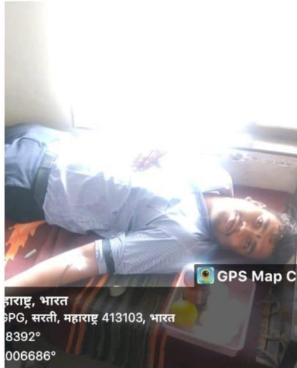
महाराष्ट्र, भारत GPG, सरती, महाराष्ट्र 413103, भारत 8392° 006686°