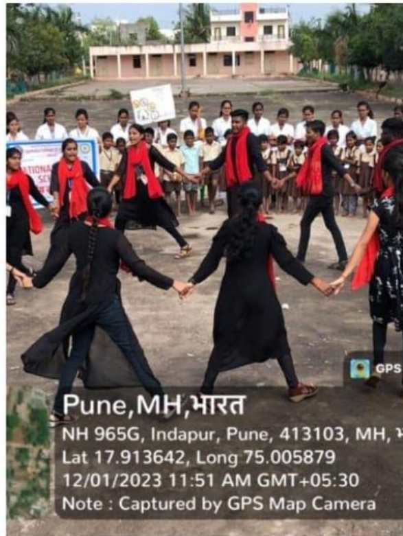
Pune, MH, भारत NH 965G, Indapur, Pune, 413103, MH, भारत Lat 17.913642, Long 75.005879 12/01/2023 11:51 AM GMT+05:30 Note : Captured by GPS Map Camera