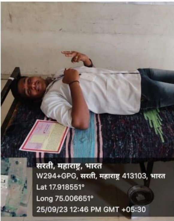
सरती, महाराष्ट्र, भारत W294+GPG, सरती, महाराष्ट्र 413103, भारत Lat 17.918551° Long 75.006651° 25/09/23 12:46 PM GMT +05:30