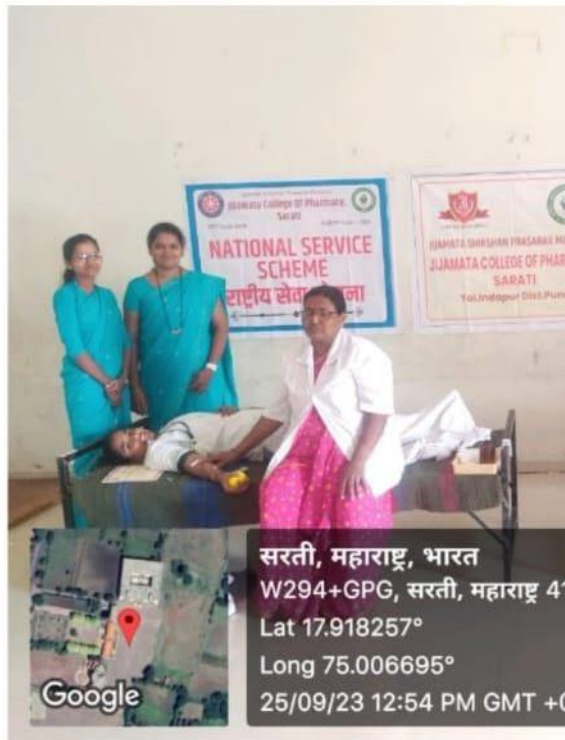
सरती, महाराष्ट्र, भारत W294+GPG, सरती, महाराष्ट्र 413103, भारत Lat 17.918257° Long 75.006695° 25/09/23 12:54 PM GMT +05:30