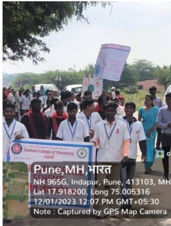
Pune, MH, भारत NH 965G, Indapur, Pune, 413103, MH, भारत Lat 17.918200, Long 75.005316 12/01/2023 12:07 PM GMT+05:30 Note : Captured by GPS Map Camera